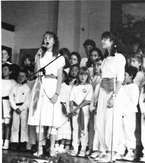
One of several Peace Child/Santa Cruz chorus performances.

Another North Carolina community, Charlotte, has been recruited by host city Peace Child/Roanoke to be a tour stop along with Charlottesville, VA for the 1990 Mid-Atlantic Region exchange. One of USA's original certified chapters, Roanoke began organizing for the 1990 program in 1988. Other Peace Child chapters in Los Angeles, Santa Cruz, Rochester and York have continued ongoing chorus performances and are all planning a full calendar of spring and