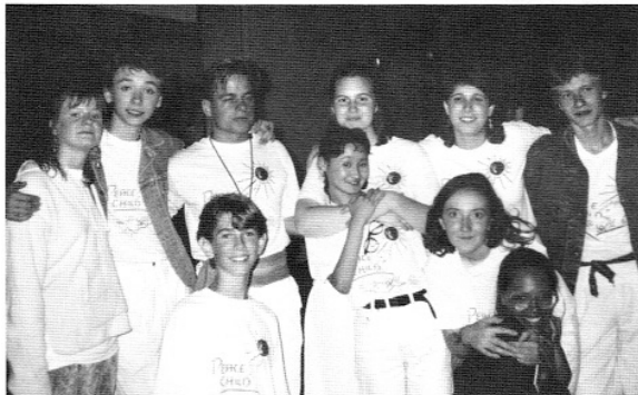
U.N. Peace Day brought together old friends and new

Throughout the year, the National Office needs volunteers to help with international exchange programs and coordination with Peace Child groups around the country. We can offer a place to stay and a small stipend for three to six month internships. Currently, we are seeking two summer interns to work with the program staff, one to work with our chapter network and one to help us with development research. You need not be under 21 to apply. If you're interested in spending a few months in the Washington, D.C. area in the challenging atmosphere of the National Office, please call (for summer positions, by May 1) 703.385.4494.