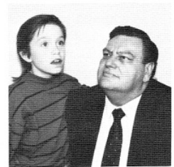
This song, "Through the Eyes of a Child", brought the audience to its feet in Chicago.