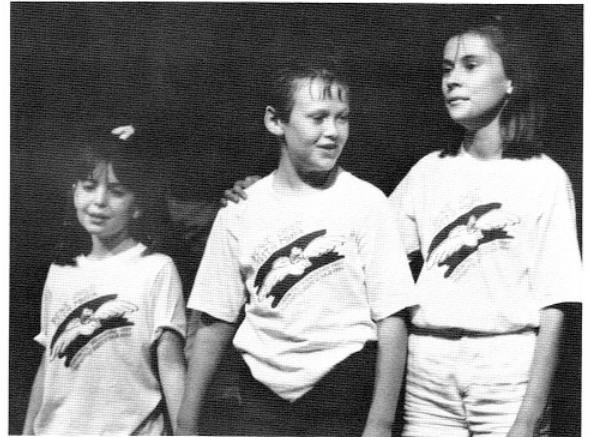
Three of the 29 young people from Volgograd and Toronto performing in Canada during their first Canadian-Soviet Peace Child production in Ottawa.

Preparations for this summer's exchange are well underway. Participation of youth from Australia, Israel, Japan, East & West Germany, Poland, Bulgaria and Spain is confirmed and with more expected from USA, USSR, Holland, India, Ireland, Kenya, South Africa and Cyprus.