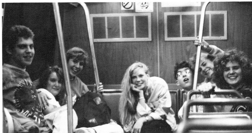
Alums from the Great Plains '89 program loved D.C.'s Metro Bus System!