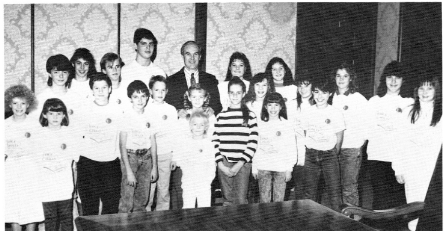
Olympia Peace Day Concert participants meeting with Governor Gardner of Washington

rienced by 24 of our group who traveled to New York for the Peace Day Concert. There was quite a media splash connecting this Concert with our upcoming shows. We 'Amtrak-ed' these per-