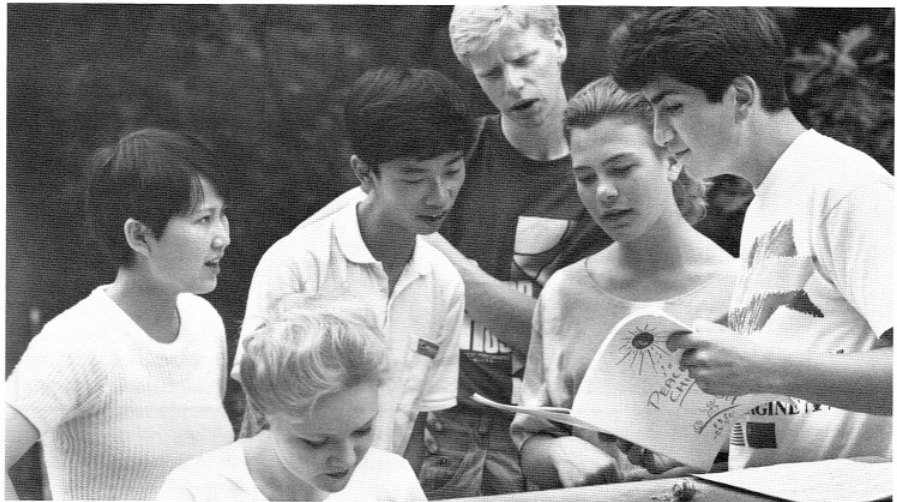
Chinese, Soviet and American cast rehearse in Fargo, North Dakota

The second year of Peace Child Japan will include two weeks of intensive language training, cultural study and homestays followed by two weeks of rehearsal. The final week of performances are scheduled in and near Hiroshima. Youth from the USA, USSR, Costa Rica, Nicaragua,