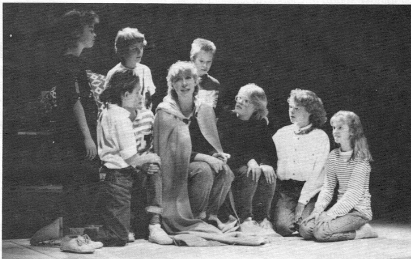
UK Production at Heathfield School. Two children from this production are joining the cast of Peace Child Japan in Hiroshima in July/August.

The play is set in the future and looks back to an incident where some innocent children are shot outside a high school (modeled on an actual incident in Washington DC.) The incident goads students of the school into action: a mass movement grows and the play reaches its climax at the Lincoln Memorial, recalling the performance there by Marian Anderson, and Martin Luther King's "I have a dream" speech.