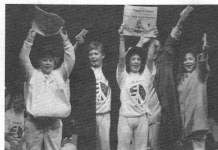
"We gotta a Story!" in Lincoln, Oregon

A production in Ruidoso, NM included may be the first two Apache Indian cast members.