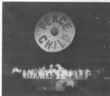
Fund-raising Concert for Peace Child USSR