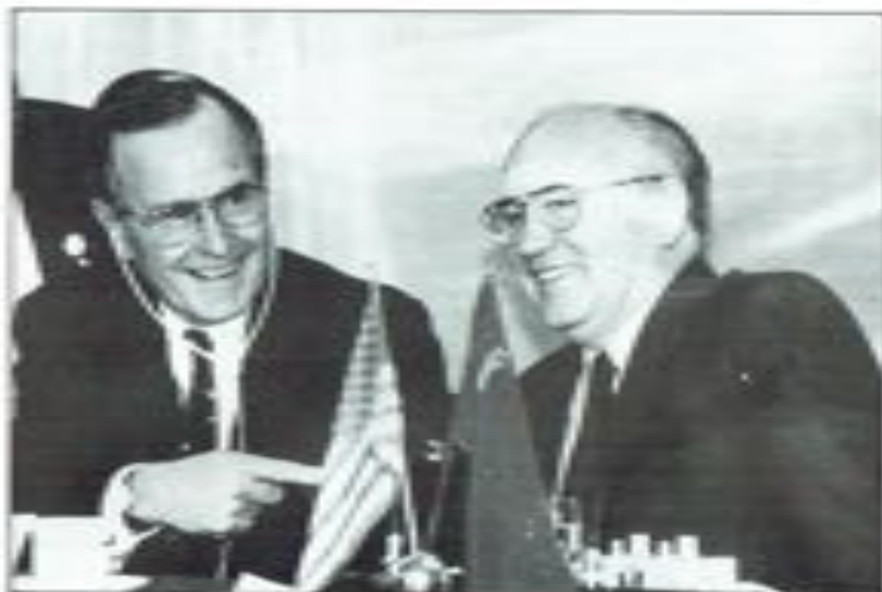
President Bush wears The Rack's Glamour Tie at White House.

The silk Glamour Tie has been designed by... and is exclusive to, The Rack. Retail price £3.95, with royalties to Cancer Relief/Macmillan Fund.